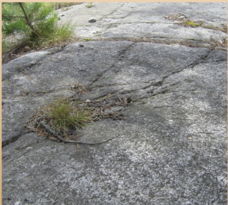
This limestone has ice scratches from a glacier.