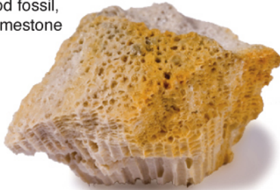
Coral changed into limestone

How do these fossils prove the area was covered by water?