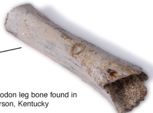
A mastodon leg bone found in Henderson, Kentucky