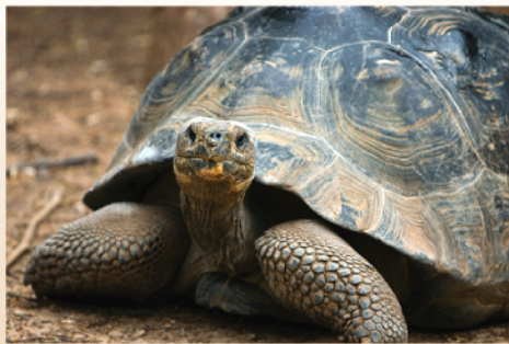
The shell of a giant land tortoise was found in Grant County, Indiana.

Why would a mastodon survive cold weather when a giant land tortoise could not?