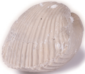
An ancient clam, a brachiopod fossil, found in limestone