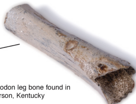
A mastodon leg bone found in Henderson, Kentucky