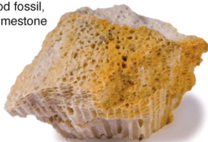
Coral changed into limestone