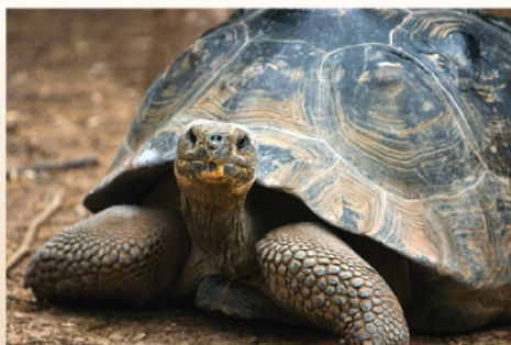
The shell of a giant land tortoise was found in Grant County, Indiana.